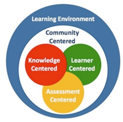
Fig. 2. Learning Environment Model - How People Learn (Bransford, 1999, 2000)

& Donovan (1999) Bransford, Pellegrino, Bransford, Brown & Cocking, 2000) has suggested four elements that must be given attention in designing learning environment in schools to enhance student's ability to be active learners who seek to understand the complex issues while willing to apply the knowledge in a variety of situations. Figure 2 shows the four elements suggested that learner-centered environment, knowledge centered environment. assessment-centered environment and community-centered environment.